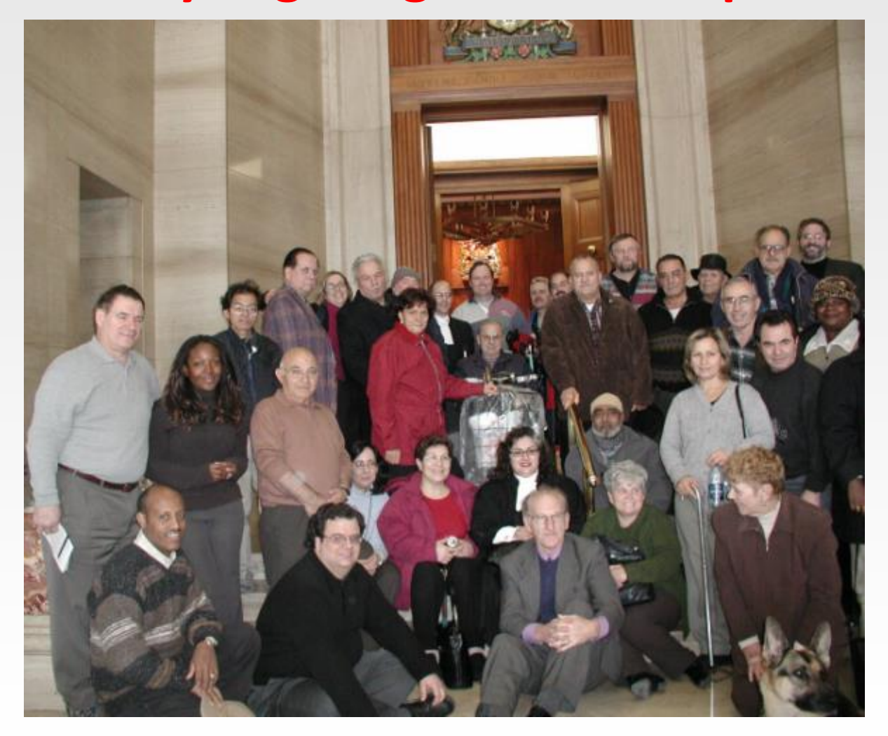
Supreme Court Victory! Dec. 2003